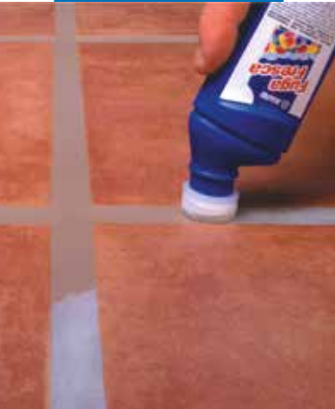
Floor in terracotta treated with Fuga Fresca