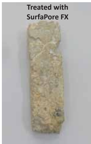
VOC (Volatile Organic Compounds): Maximum VOC content of this product is 1g/L.