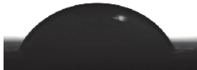
Water droplet on painted surface with normal paint Contact angle: 60°

SurfaPaint Aqua X is a water repelling paint that protects the masonry surface while it allows it to breathe. As it repels water and reduces water absorption, it prevents premature paint failure and mould growth. Subsequently, the substrate is efficiently protected and therefore not affected by external, weathering factors. SurfaPaint Aqua X exhibits its functionality for a long period of time, extending the life of the paint coated surface. The paint is white and can be tinted with pal colours. Hydrophobic properties of a SurfaPaint Aqua X are depicted below.