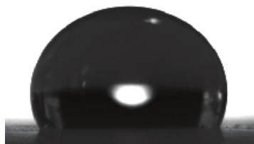
Water droplet on painted surface with SurfaPaint Aqua X Contact angle: 126°