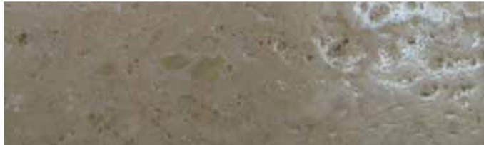
Food stains on stone surface with SurfaPaint Stone Varnish WB. 24 hours after, the stains were removed with water and paper