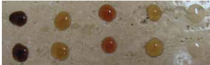
Coffee Tea Wine Oil Water